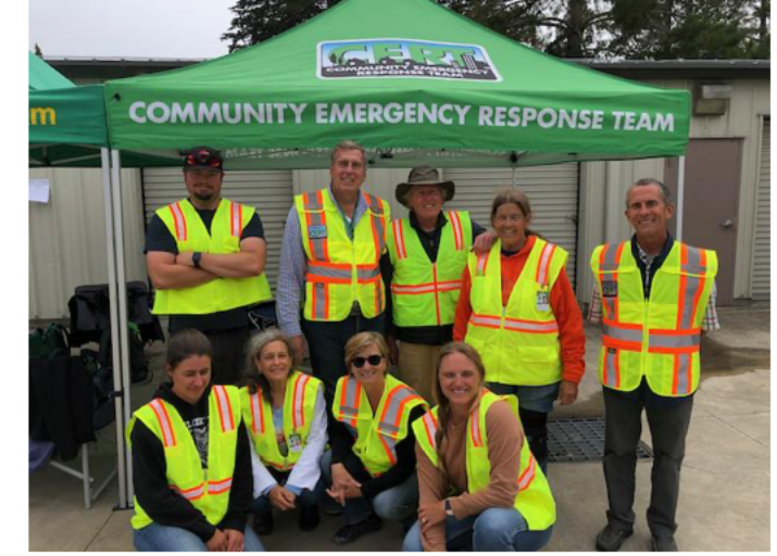
Hybrid Grads June 5th