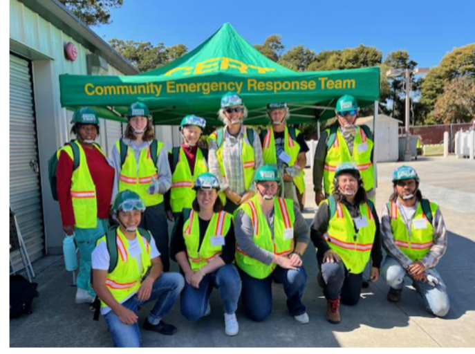
In-person Grads September 17