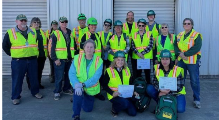
In-person Grads November 13