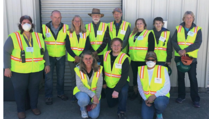
Hybrid Grads March 26